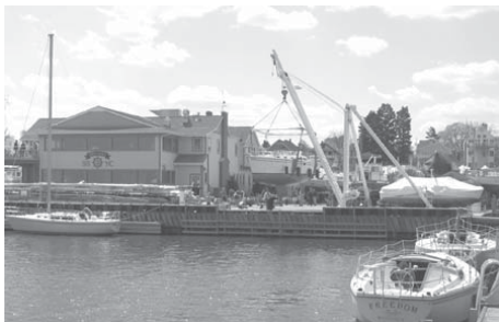
The first day of launch was off to a good start on Saturday, May 2, 2009.

Continued - Please See St. Clair River Report - Page 7